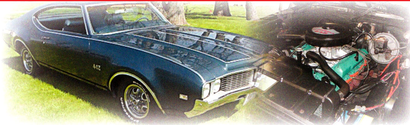
Photos of Oldsmobile 442 and 442 engine courtesy of ClassicMuscleCars.com .